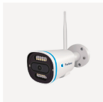
PoolScout Wi-Fi Camera